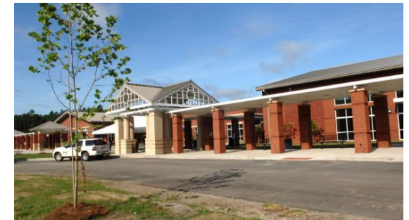
Godley Station K-8 School Opened August 2010

From School to the World: All Students Prepared for Productive Futures